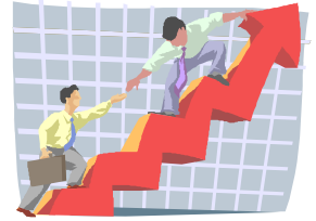
Hours Invested (During Lifetime)